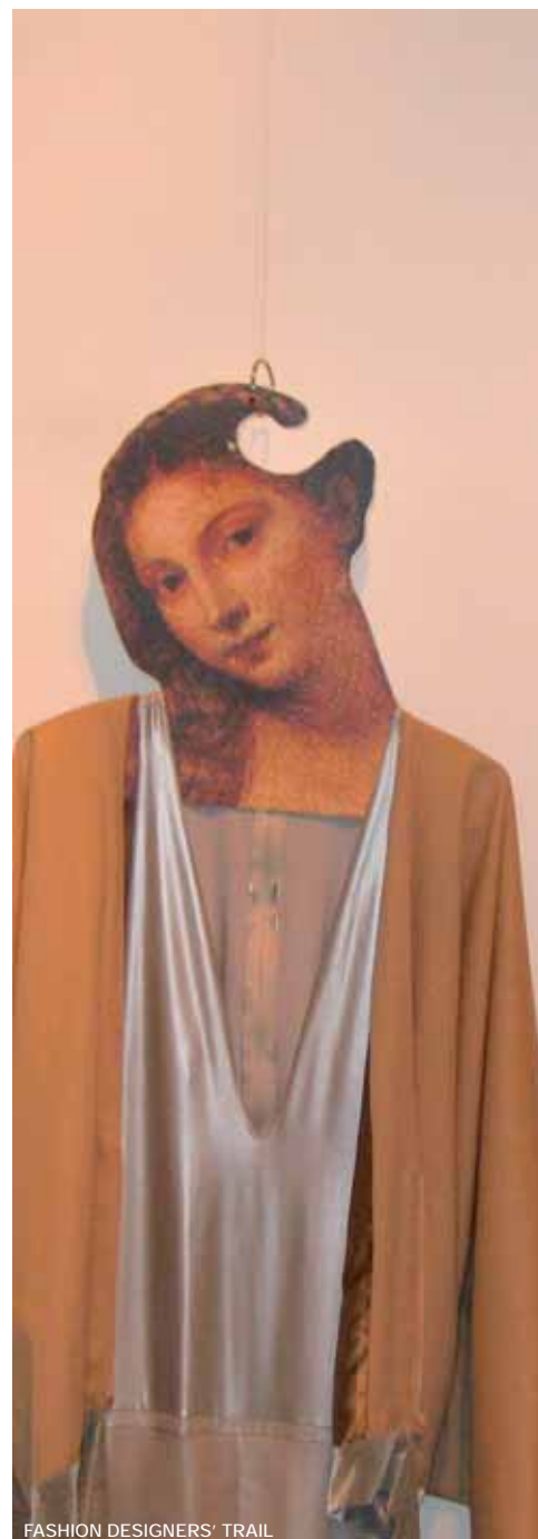
FASHION DESIGNERS' TRAIL