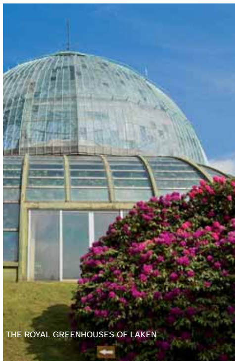
THE ROYAL GREENHOUSES OF LAKEN