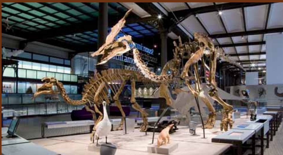
MUSEUM OF NATURAL SCIENCES

7.00 € at the Tourist Information Brussels - TIB